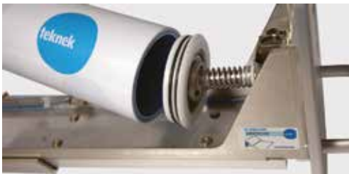
Quick release holder " QRH "

Threading up of the web is made very easy with the opening top half of the NWP. This feature also allows the operator full access to the elastomer rollers for cleaning. Easily removable side covers gives great maintenance access.