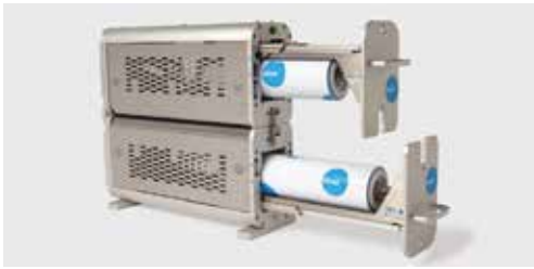
Side Access to Teknek Pre-Sheeted Adhesive

The operator has full side access to the Teknek Pre-Sheeted Adhesive Rolls for purging. This ensures the NWP can be fully integrated into the line or process.