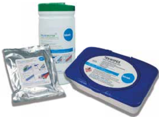
Roller Maintenance Products

NWP 600 & 750 widths are available or request