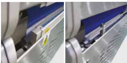
Active Anti Static System

Flexibility in mounting position ensure the NWP can be fully integrated into many applications. The machine can be mounted in both vertical and horizontal positions depending on the requirements of the application.