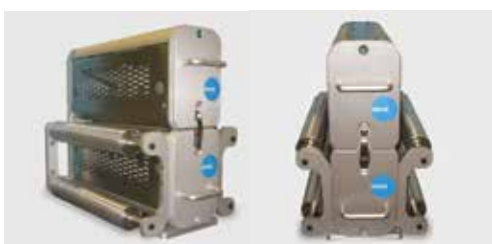
Optional Diverter Rollers

The NWP has the option of two different Anti Static systems, active and passive. Mounted on the exit of the machine each system will greatly reduce the risk of re-contamination of the web after cleaning.