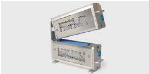
Full and easy access

The operator has full side access to the Teknek Pre-Sheeted Adhesive Rolls for purging. This ensures the NWP can be fully integrated into the line or process.